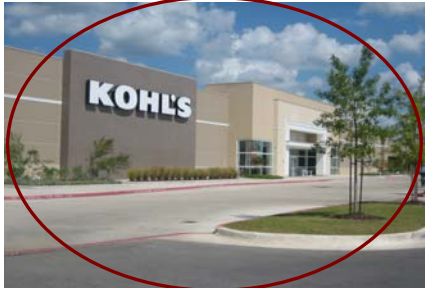
Central Station Shopping Center Redevelopment

No project is too big or too small for Mitchell & Morgan, LLP. Whether your project deals with a traditional engineering problem or a more complicated situation, Mitchell & Morgan approaches every project by providing the client cost effective, creative & timely solutions to achieve the objectives. The firm's success has primarily been due to the ability to offer clients expert analysis based on extensive knowledge of City codes and a thorough background rooted in the civil engineering industry.