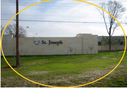
St. Joseph's Hospital ~ College Station Campus