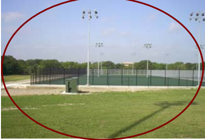
Texas A&M University Tennis Courts

No project is too big or too small for Mitchell & Morgan, LLP. Whether your project deals with a traditional engineering problem or a more complicated situation, Mitchell & Morgan approaches every project by providing the client cost effective, creative & timely solutions to achieve the objectives. The firm's success has primarily been due to the ability to offer clients expert analysis based on extensive knowledge of City codes and a thorough background rooted in the civil engineering industry.