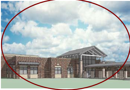
Forest Ridge Elementary School College Station